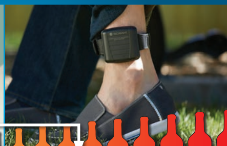
SCRAM Continuous Alcohol Monitoring